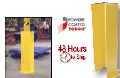
POWDER COATED TOUGH