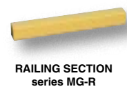
RAILING SECTION series MG-R