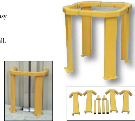
Fits against walls to protect drains or piping