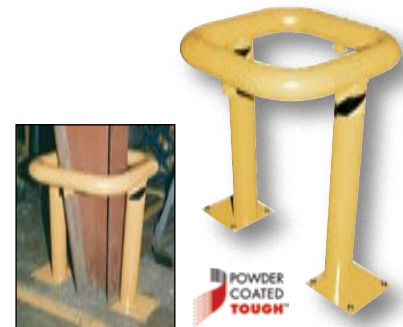
POWDER COATED TOUGH