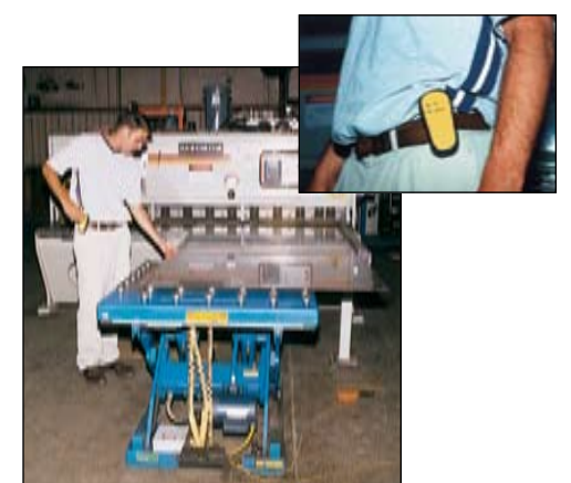
WIRELESS REMOTE CONTROL IS FACTORY INSTALLED

Rigid PVC and Roller Curtains Also Available - Contact Factory