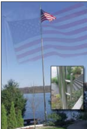
FLAG SOLD SEPARATELY