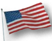
Width of flag should not exceed 25% of the flag pole height