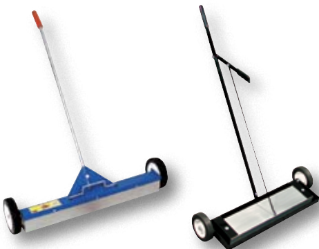
TYPE A MANUAL PUSH SWEEPER

Easy to use Push Magnet features stainless steel face plates. Deep permanent magnetic field never needs recharged. Features a 30" long steel handle with an easy to use hand release.