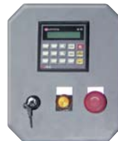
PROGRAMMABLE HEIGHT model PROGRAM