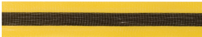
WBT-75 Y/B and WBT-2 Y/B