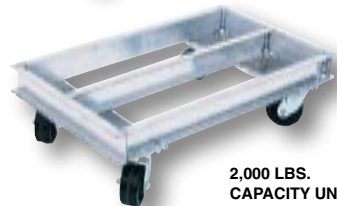
2,000 LBS. CAPACITY UNITS