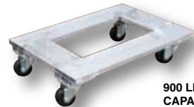
900 LBS. CAPACITY UNITS