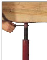
model FJB-36 shown