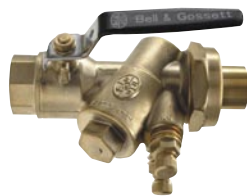
Circuit Sentry™ Automatic Flow Limiting Valve

Bell & Gossett also manufactures centrifugal pumps, residential circulators, hydronic accessories and valves. Phone: (847) 966-3700, Fax: (847) 966-9052 www.bellgossett.com