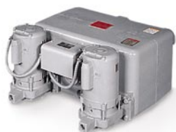
Domestic Pump Condensate Transfer Package

Phone: 847-966-3700, Fax: 847-966-2106 www.domesticpump.com