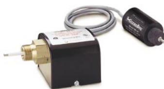
McDonnell & Miller Low Water Cut-Off

Phone: 773-267-1600, Fax: 773-267-0991 www.mcdonnellmiller.com