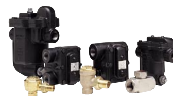
Hoffman Steam Traps

Phone: 773-267-1600, Fax: 773-267-0991 www.hoffmanspecialty.com