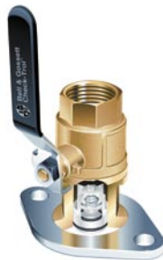
Chek-Trol™ Isolation Flow Control Flange