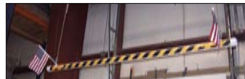
ECONOMY WARNING BARRIER • model ODG-121-F