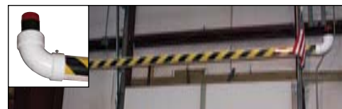
DELUXE WARNING BARRIER • model ODG-133-BL