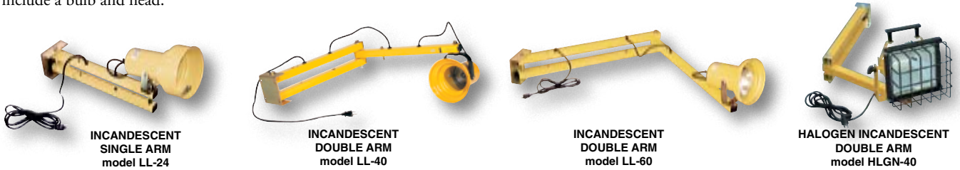
INCANDESCENT SINGLE ARM model LL-24

Spun Aluminum Dock Lights, series LL-SAI and LL-SAF, stay cool to the touch even with a 300 watt incandescent light. Features strut arm with both horizontal and vertical adjustment. Available in a standard incandescent lamp head and a fluorescent lamp head. Fluorescent units include a bulb and head.