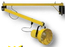
INCANDESCENT series LL-SAI