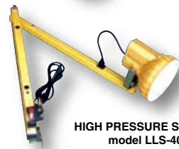
HIGH PRESSURE SODIUM model LLS-40