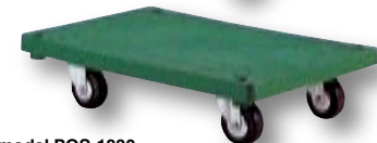
model POS-1830 & POS-2133