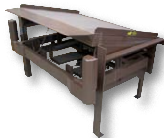
DOCKLEVELER WITH LEGS FOR FRONT OF DOCK PLACEMENT series PU