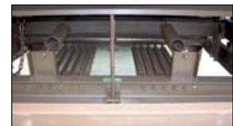
HEAVY-DUTY SPRINGS HELP LIFT THE CARRIAGE WHEN A TRUCK COMES INTO CONTACT WITH THE DOCKLEVELER

CAPACITIES TO 100,000 POUNDS AVAILABLE - CONTACT FACTORY