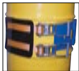
DUAL RATCHET STRAP model FDRS