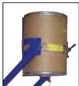
NYLON STRAP model FDA-250