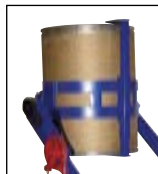
ADJUSTING ARM model FDA-550