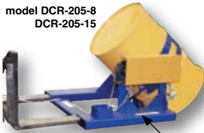
model DCR-205-8 DCR-205-15