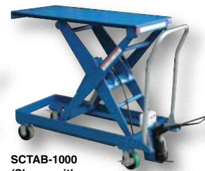
SCTAB-1000 (Shown with Caster/Handle Kit)