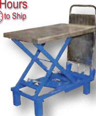
SCTAB-400 SCTAB-800D (double) (not shown)