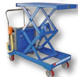
SCTAB-750D (shown with DC power option and caster handle kit)