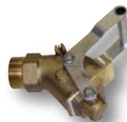
model JDFT-B Non-Adjustable Nozzle