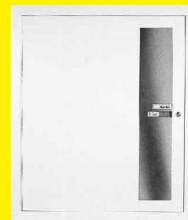
-DVL Duo-Vertical Panel with Lock