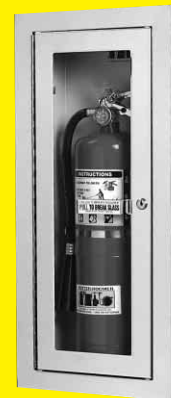
-B Full Break Glass

Break Rite™ Fire Extinguisher Cabinets from Potter-Roemer. Because a fire is enough to deal with, and life-safety products should be safe!