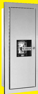
-E Center Break Glass