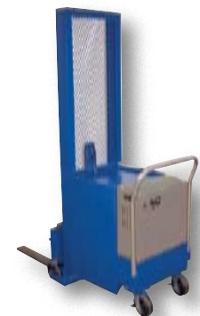
COUNTER BALANCED STACKER