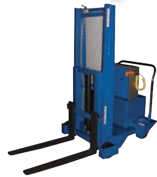
COUNTER-BALANCED PALLET MASTER/SERVER