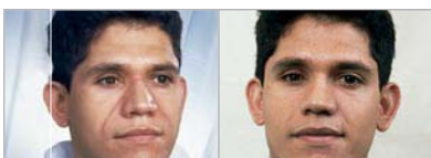
Helps reduce ring around the nose.