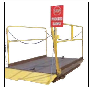
STOP SIGNAL SIGN model WL-SSS