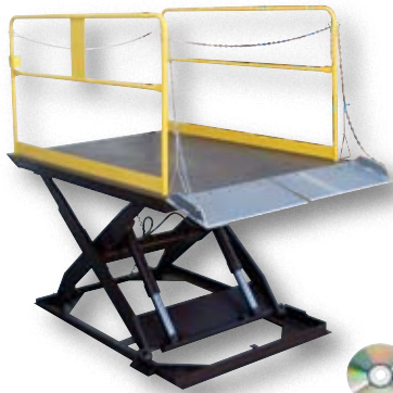
Shown with Optional Aluminum Bridge