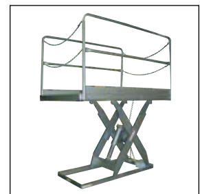
GALVANIZED FRAME AND DECK model SPO-WL-LS-ZRC