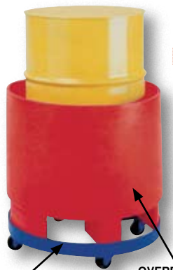
OVERPACK DRUM DOLLY series DRUM-SP