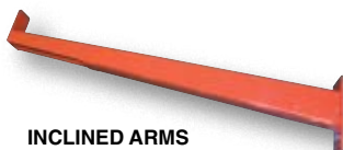
INCLINED ARMS series HIA-C