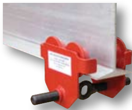
PLAIN EYE MANUAL TROLLEY model E-MT-1