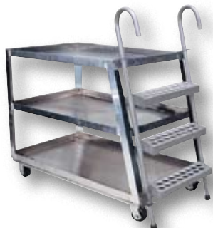
ALUMINUM THREE SHELF series SPA3