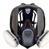
Air Purifying Respirator