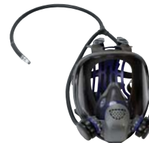
Dual Airline Supplied Air Respirator

The Ultimate FX FF-400 also comes with innovative accessories that can enhance comfort and performance.