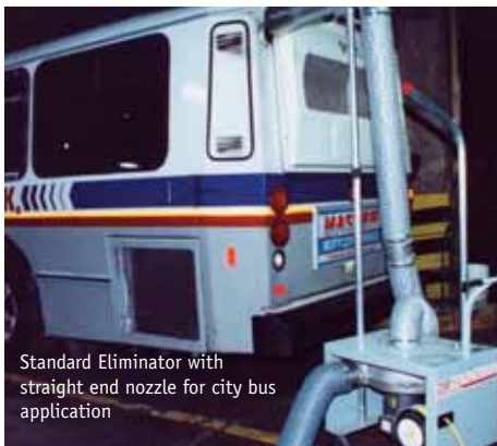
Standard Eliminator with straight end nozzle for city bus application