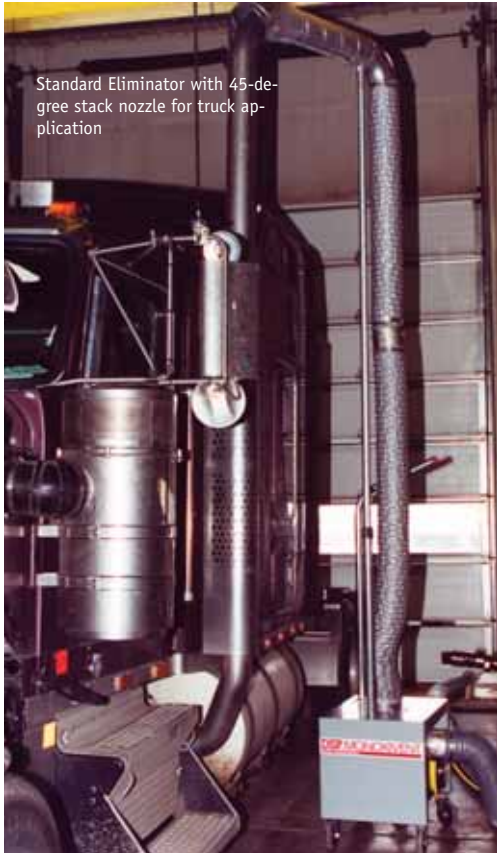
Standard Eliminator with 45-degree stack nozzle for truck application