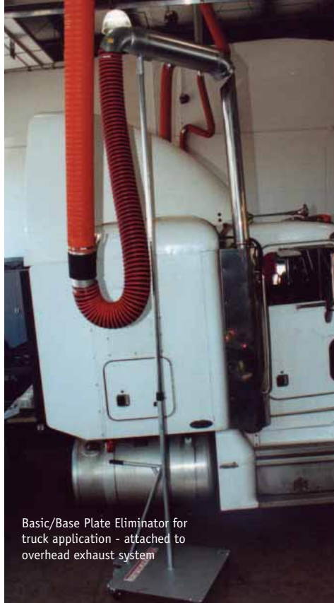
Basic/Base Plate Eliminator for truck application - attached to overhead exhaust system