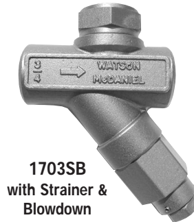
1703SB with Strainer & Blowdown

1703S with Strainer 1703SB with Strainer & Blowdown