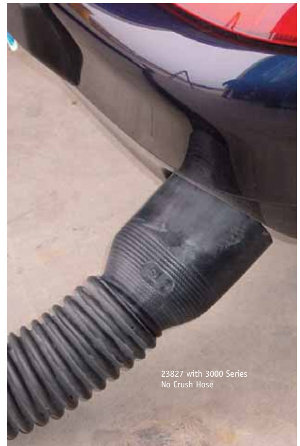
23827 with 3000 Series No Crush Hose