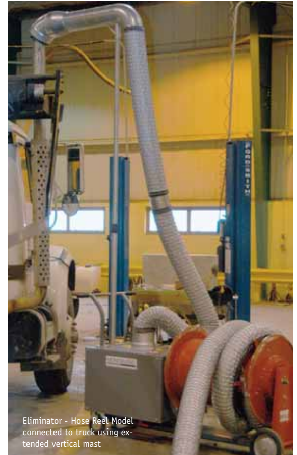
Eliminator - Hose Reel Model connected to truck using extended vertical mast