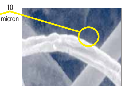
Conventional media has spaces of up to 60 microns between fibers, allowing dust to become deeply embedded thereby shortening filter life.

MNX Filter Media Pleats are shorter and stiffer, which helps minimize dust entrapment and simplify filter cleaning. With the 1.5" option, the pleat wall is less likely to collapse or bend, which can trap dust and prevent its release. However, the 2" option allows for more versatility with regard to CFM.