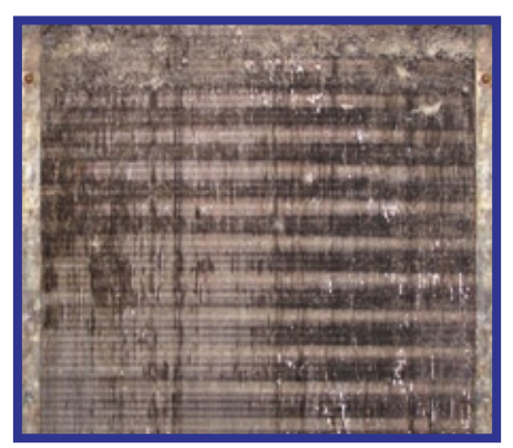
Coil with mold

BLUE-TUBE UV <sup>™</sup> is the simple and complete choice in UV light for all residential applications. Everything you need is in the tube! Just connect to a low voltage transformer and install the UV light where needed.