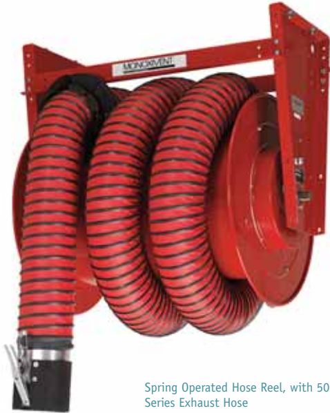
Spring Operated Hose Reel, with 5000 Series Exhaust Hose