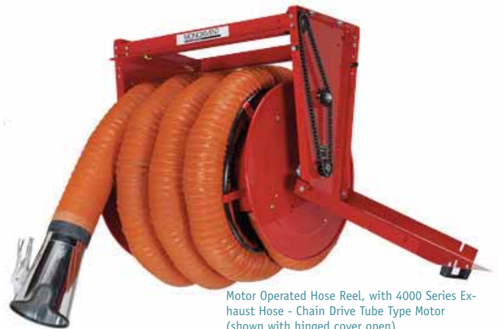
Motor Operated Hose Reel, with 4000 Series Exhaust Hose - Chain Drive Tube Type Motor (shown with hinged cover open)

Note, Models above are standard. Models are shown with either 4000 or 5000 Series Hose and may be Spring Retractable or Motor Operated. Other hose options are available.