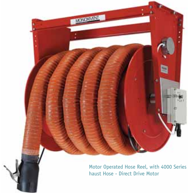
Motor Operated Hose Reel, with 4000 Series Exhaust Hose - Direct Drive Motor