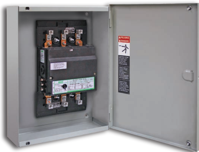
ASCO 920 Remote Control Switch in Type 1 Enclosure

The ASCO 920 is designed as a feeder disconnect switch for load capacities beyond the ASCO 917. ASCO 920 RC switches are available for separate mounting in NEMA type enclosures or direct mounting within lighting panelboards for total or split-bus applications.