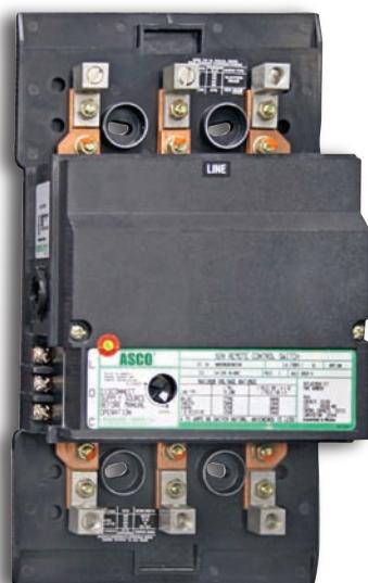
ASCO 920 Remote Control Switch with sub-panel

Example: The catalog number for an ASCO 920, 3-pole, 225-amp switch with a control coil voltage of 277 volts, 60 Hz, with an Optional Accessory 48 and a sub-panel, in a NEMA Type 1 enclosure is: 920322571XC with option 48A(120V)