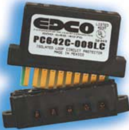
EDCO PCB1B BASE SOLD SEPARATELY