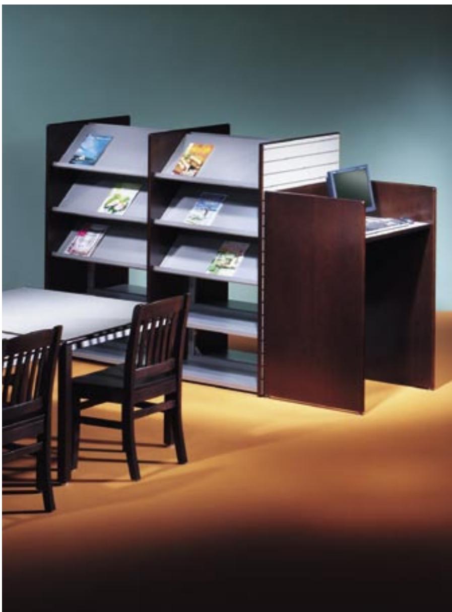
READING TABLE / SEISMIC SHELVING / SLATWALL END PANELS / PATRON ACCESS STATION

11000 SEYMOUR AVENUE FRANKLIN PARK, ILLINOIS 60131 USA TOLL FREE PHONE 800-521-9614 PHONE 847-678-2545 TOLL FREE FAX 800-343-1779 FAX 847-678-0852