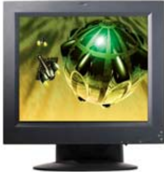
Play Video Games