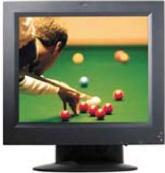
Full Screen Live TV Viewing