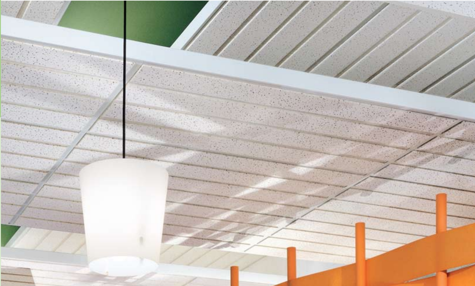
RADAR Illusion Four/48 Panels with CLIMAPLUS Superior Performance/ DONN DX/DXL Suspension System

Year Availability 2842, 2852, 2862, 2882