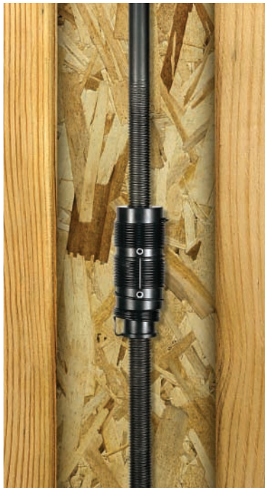
The new Coupling Take-Up Device utilizes fewer parts, thereby streamlining installation and reducing labor costs

The Simpson Strong-Tie® Anchor Tiedown System for Multi-Story Overturning Restraint catalog (C-ATS) puts all the product and design information right at your fingertips, including technical information, multi-story rod system design concepts and schematics for runs up to five stories. Visit www.strongtie.com to download or request a copy or call (800) 999-5099.