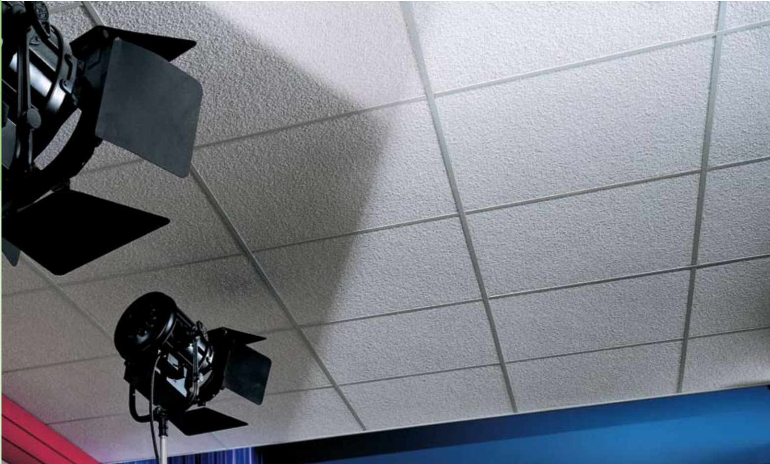
PREMIER NUBBY Panels with CLIMAPLUS Performance/ DONN CENTRICITEE DXT Suspension System