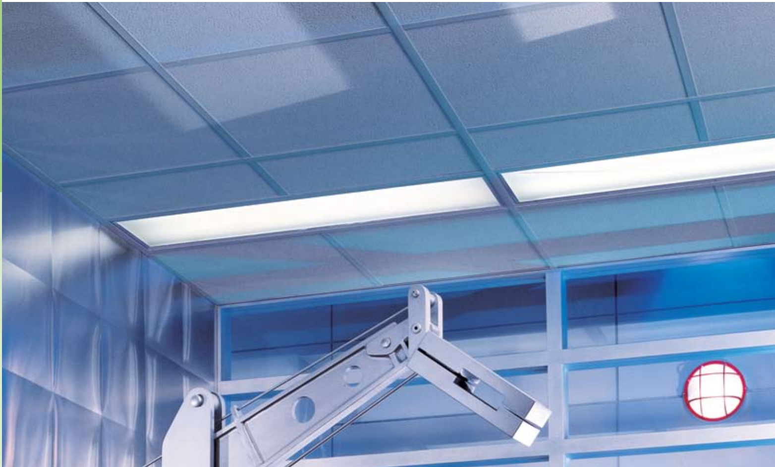
CLEAN ROOM Class 10M–100M Panels with CLIMAPLUS Performance/ DONN DXLA Suspension System