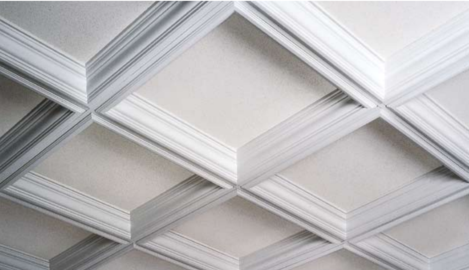
QUADRA Crown Ceiling Coffers/ DONN DX/DXL Suspension System