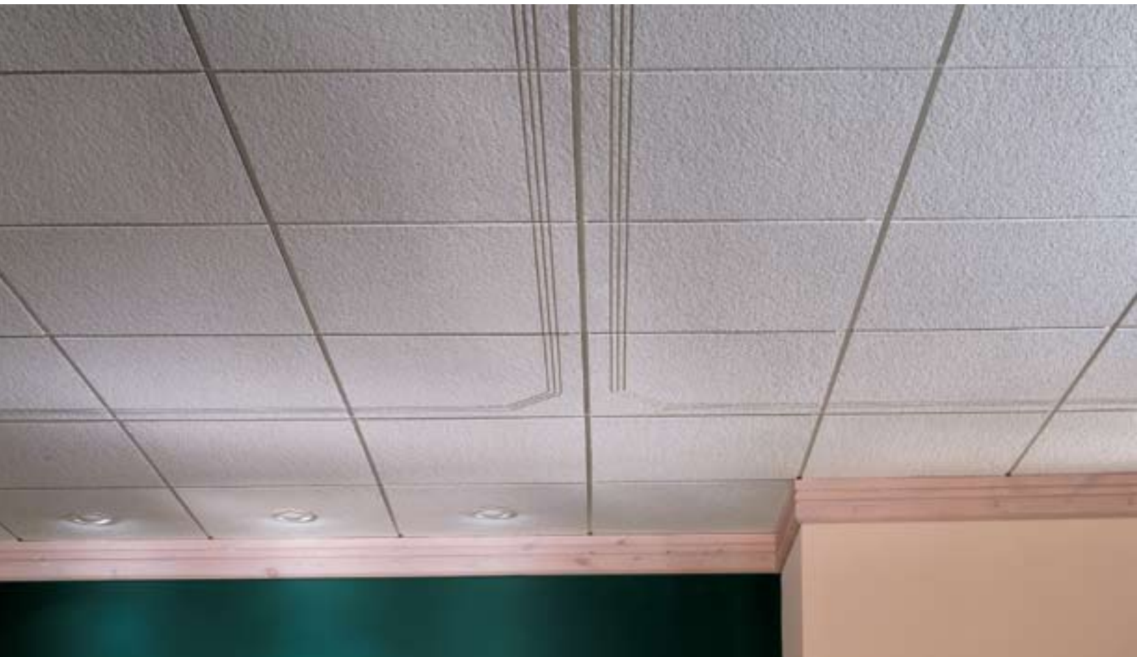
RENDITIONS Face-Routed Ceiling Panels with Boundaries Pattern/ FROST Panels/DOWN CENTRICITEE Suspension System