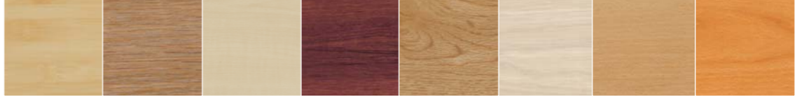
Creation Wood colour range