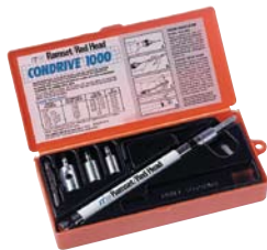
Part No. C1000 (Does not include drill bit)

The key to Tapcon's fast and easy installation is the multi-purpose Condrive Installation Tool. The drive sleeve, along with the hex head and Phillips sockets provide the installer with the flexibility necessary for the complete variety of Tapcon applications.