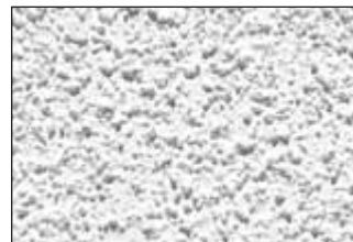
Perfect Spray Ceiling Texture -Medium