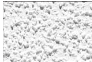
Perfect Spray Ceiling Texture -Coarse

Spray textures should not be applied over a vapor barrier spray which is not dry.