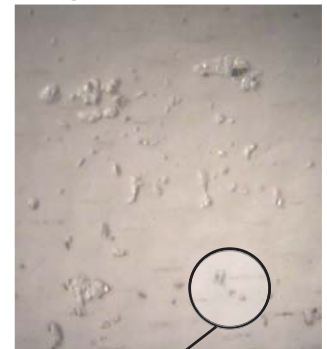
Thermoplastic with a Porous Surface which can trap dirt and moisture