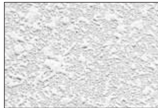
Perfect Spray EM/HF -Orange Peel

Note: These are general instructions. Complete, easy-to-follow application guidelines are printed on all bags of Perfect Spray EM or Perfect Spray HF. Close adherence to instructions for surface preparation and priming will avoid the problems of color variation, bleeding or sagging, and will permit the texture to achieve its full potential.