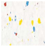
51983 party white