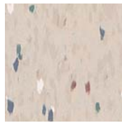
51976 multi taupe

NOTE: Darker-colored patterns may be susceptible to scratch whitening. This color may require more frequent maintenance if used in field areas: 51970.