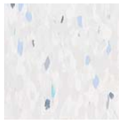
51974 polychrome white