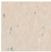
51980 multi ecru