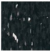
51970 mono black