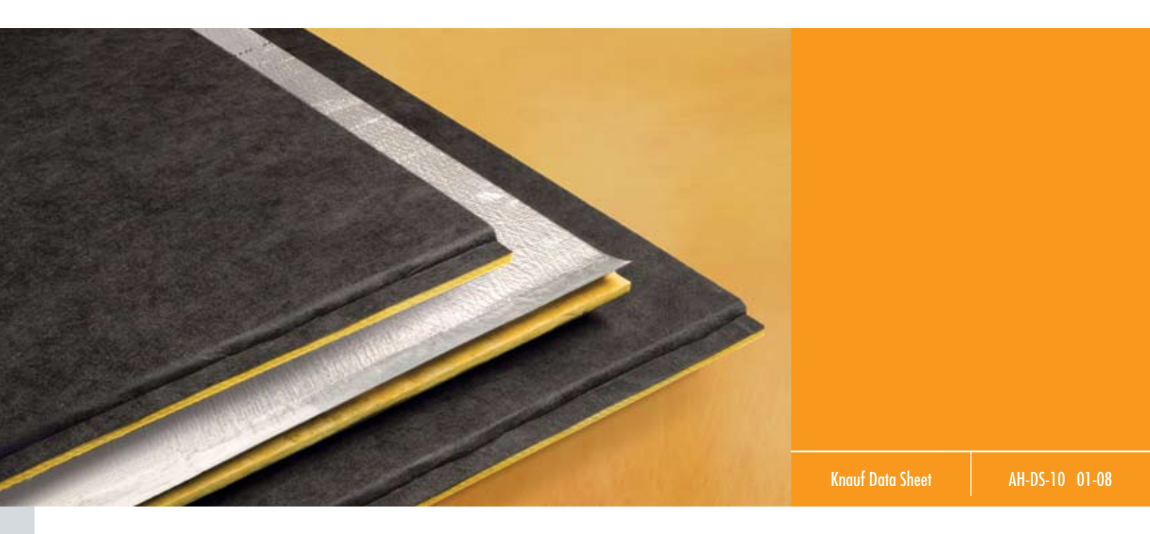
Eclipse™ Air Duct Board