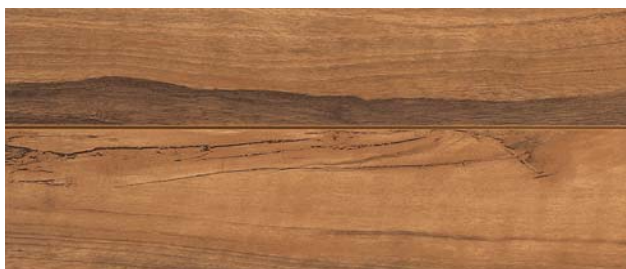
L8710 mystic walnut