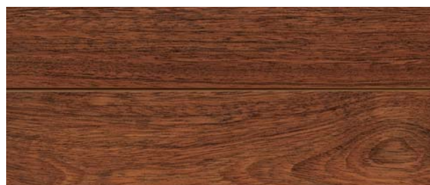
L8711 toasty jatoba