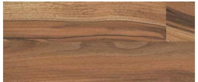
L8719 toffee walnut