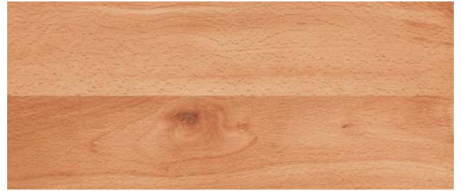
L8718 tawny tan beech