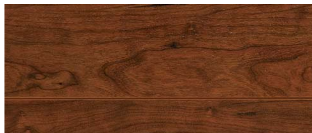
L8714 ornamental cherry