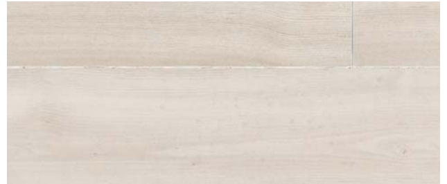
L8703 blizzard pine