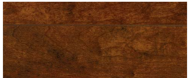
L8701 candied cherry