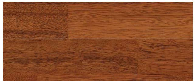
L8716 spiced merbau