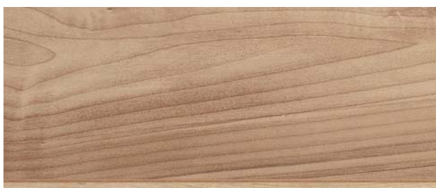
L8709 desert tan maple