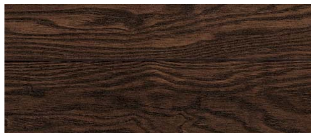
L8707 forestwood ash