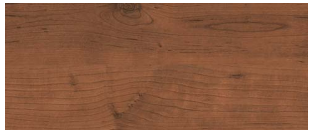
L8717 earthen cherry