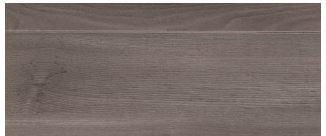
L8702 adrift pine