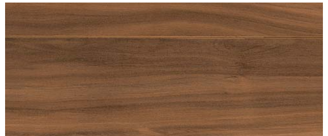
L8700 summer tan fruitwood