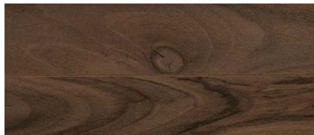
L8705 tree branch walnut