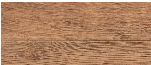
L8713 natural oak