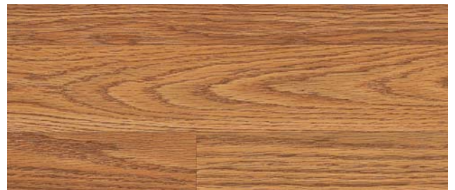
L8715 butterscotch oak