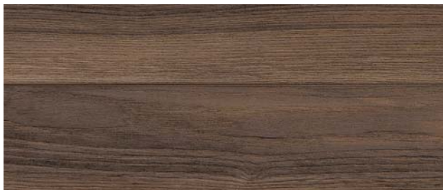
L8708 exotic olive ash