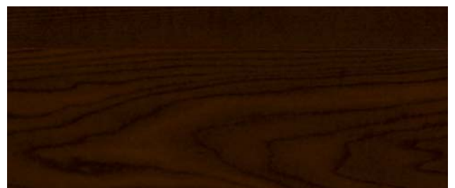
L8704 forest brown maple