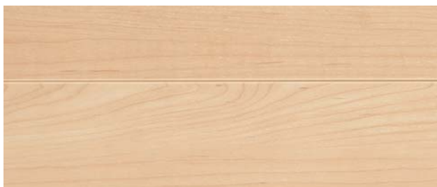
L8712 american maple