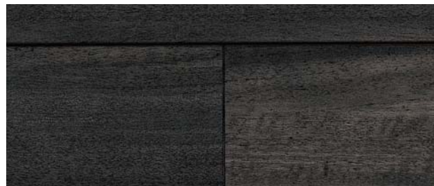
L8706 midnight maple