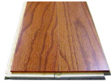
LOCK IN PLACE

Our TRADITIONAL COLLECTION installs using the simple ArmaLock ® system. Each piece aligns automatically, making installation easier than ever.